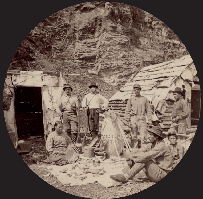
M12833 | Photography | Huron-Wendat Group, Wendake (Lorette), QC, approximately 1875